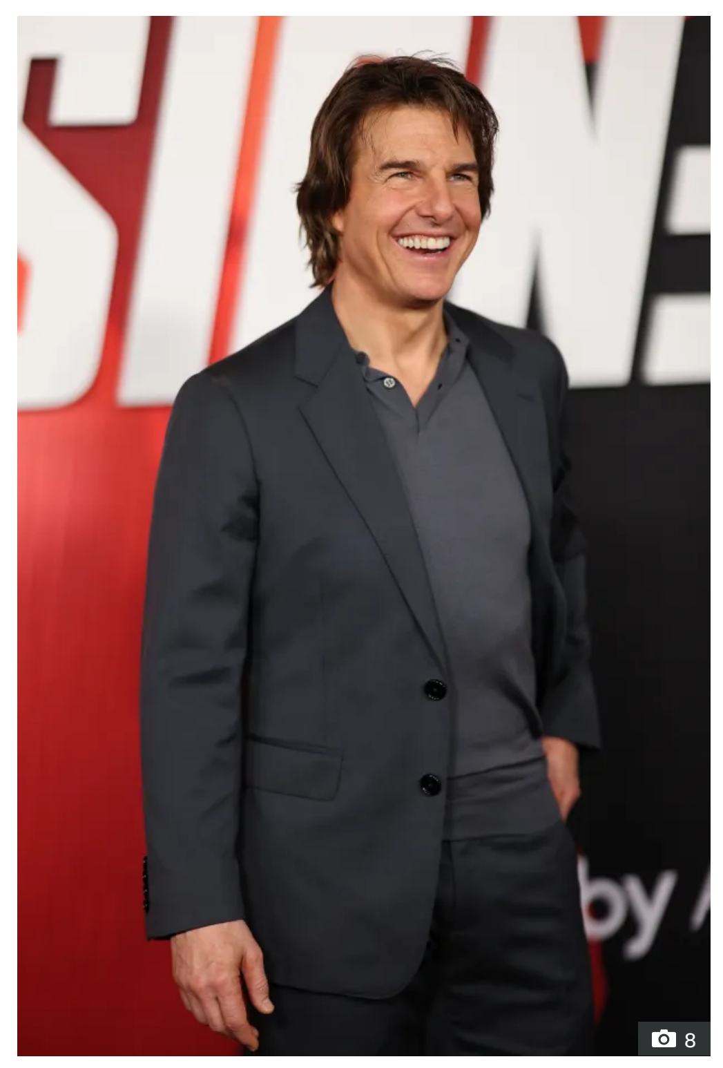
Tom Cruise has appeared in numerous movies including Top Gun